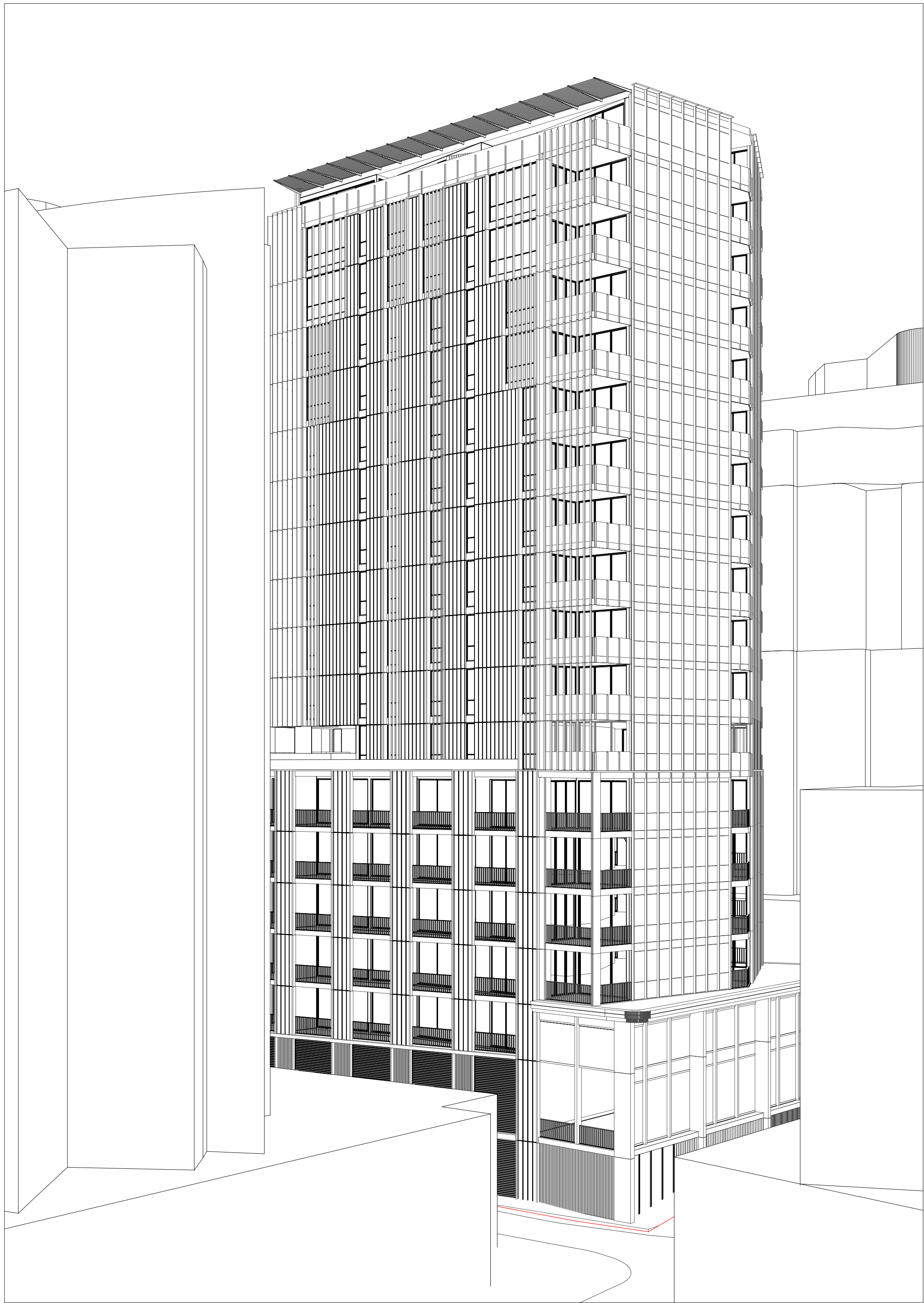
VIEW FROM SYDNEY EINFELD DRIVE